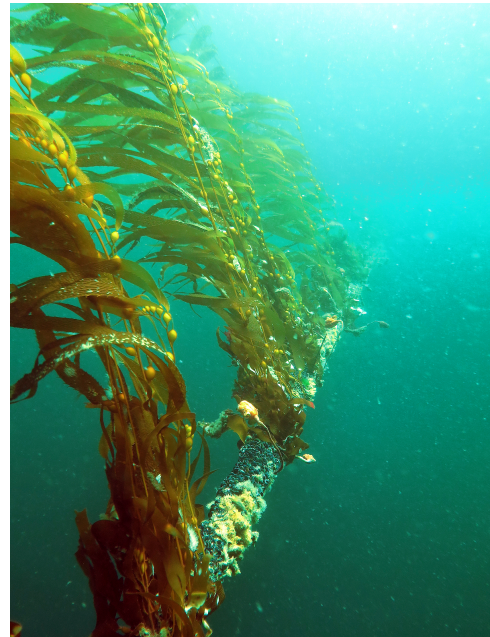
Photo right: The giant kelp flourishing at the end of 2020.

Thanks again for your help. Because of you, CF has supported the Institute for Marine and Antarctic Studies (IMAS) in its efforts to develop methods of natural kelp restoration. If we all work together, we can make a difference.