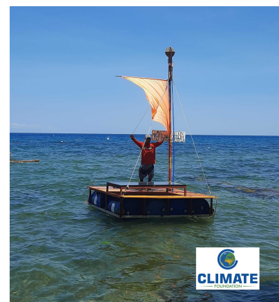
Photo - right: Team member July Gadia triumphantly standing on one of our builds during lockdown.

More good news! The Philippines team successfully irrigated red seaweeds with upwelled water on a deepwater Marine Permaculture platform more than 300 meters deep. Even with Covid-19 going on, our team of heroes secured permits as an essential agricultural service, which allowed them to continue working during the lock-down. They didn't stop there - and went on to secure permits from the Filipino Navy, the coast guard, the local barangay and fisheries commissions.