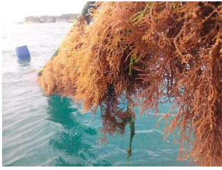
Our Cottonii seaweed.