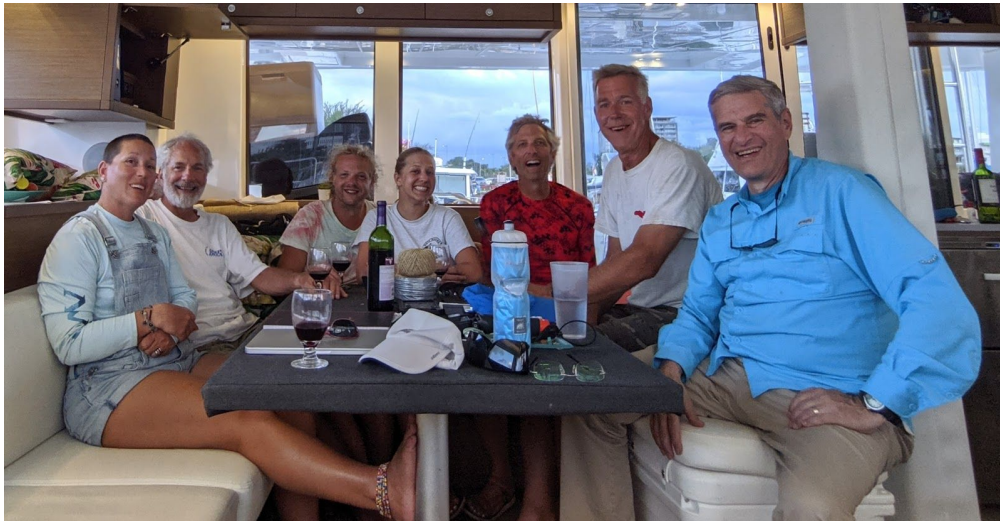
Puerto Rico work team and local recruits