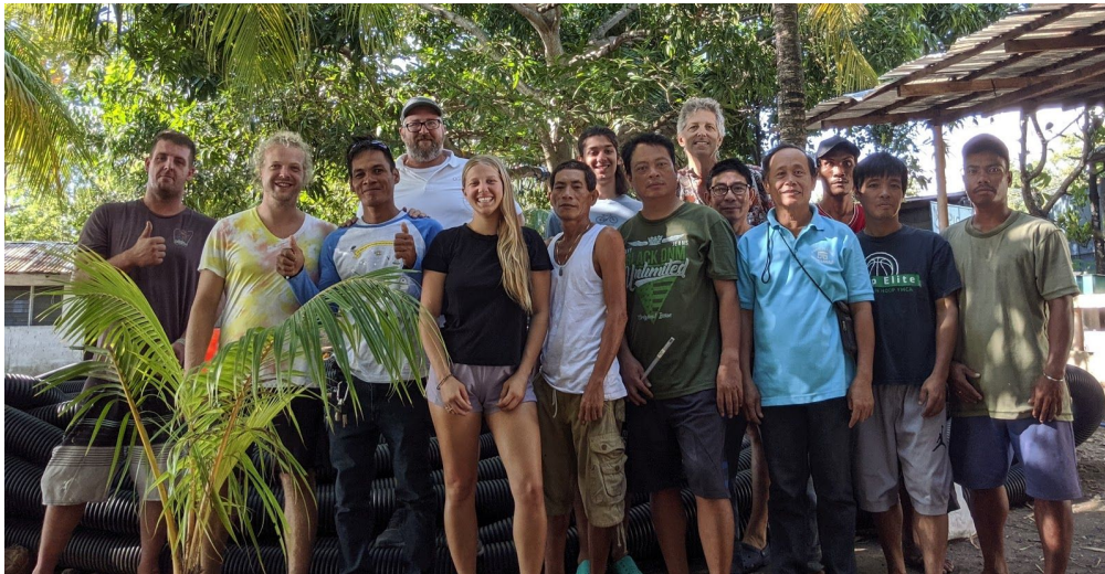
The Philippine team at the worksite on the Island of Cebu

Great progress is being made in the Philippines thanks to the Grantham Trust ( link here ) which we received in October last year. This grant is enabling the Climate Foundation to validate key results for Marine Permaculture development while gathering the important data needed to renew the seaweed industry.